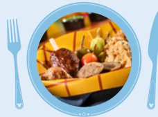
TABLE-SERVICE MEAL: Tuck in at the western-themed Roundup Rodeo BBQ . Enjoy tasty options like the house-smoked platter, or watermelon salad. Don't miss the Rodeo cocktails and remember your dessert – try the Cupcake à la Forky!

QUICK-SERVICE MEAL: Discover waffle bowls filled with delicious house-made delicacies at Fairfax Fare . Try the plant-based soba noodle salad bowl with Chik'n and yakisoba sauce.