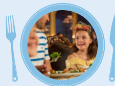
TABLE-SERVICE MEAL: Enter the Beast's enchanted castle at Be Our Guest Restaurant for a signature princess-inspired meal you'll never forget! Try the roasted poulet rouge chicken with a French 75 cocktail. (In exchange for two Table-Service Meals)

QUICK-SERVICE MEAL: Step into Sleepy Hollow , a quaint little cottage by Cinderella Castle and sample a fresh fruit waffle sandwich and cold-brew Joffrey's Coffee™ French roast.