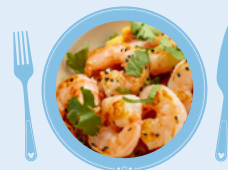
TABLE-SERVICE MEAL: Enjoy a flavour of the Mediterranean at Spice Road Table with the garlic, chilli and peri-peri spicy shrimp, Moroccan dessert platter and iced-mint tea.

QUICK-SERVICE MEAL: A celebration of the American backyard, Regal Eagle Smokehouse: Craft Drafts & Barbecue offers mouthwatering meals like the power greens salad with chicken and the Samuel Adams Boston Lager.