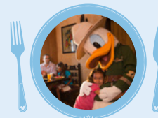
TABLE-SERVICE MEAL: Graze on an African-inspired buffet with Donald Duck and friends at Tusker House Restaurant . Including dips, salads, spit-roasted meats, plant-based options, and tasty sides. Don't miss the African Margarita.

QUICK-SERVICE MEAL: Sample dishes that are out of this world at Satu'li Canteen . Tuck into the Ocean Moon Bowl which features blue noodles, tuna, watermelon and fresh veg with a miso and soy drizzle with a refreshing Pandorian Sunrise juice.