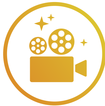
MOVIES UNDER THE STARS