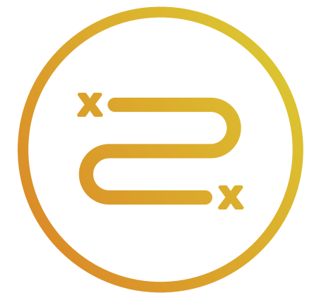
JOGGING SEVERAL PATHS AROUND CRESCENT LAKE AND DISNEY'S YACHT AND BEACH CLUB RESORTS