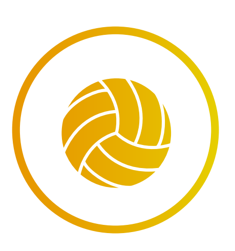
SAND VOLLEYBALL COURT