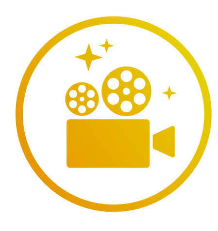
MOVIES UNDER THE STARS