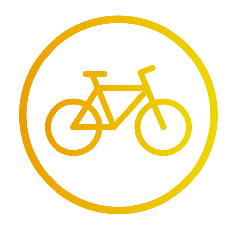
BIKE & SURREY BIKE RENTALS