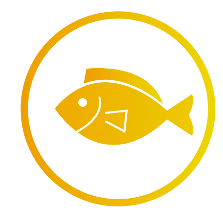
GUIDED FISHING EXCURSIONS