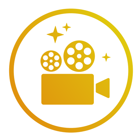
MOVIES UNDER THE STARS