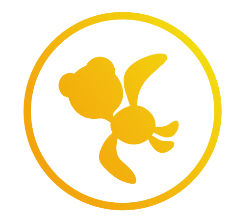
RIGHTEOUS REEF PLAYGROUND