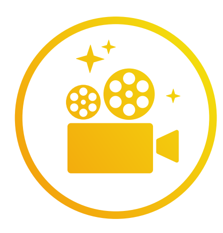
MOVIES UNDER THE STARS